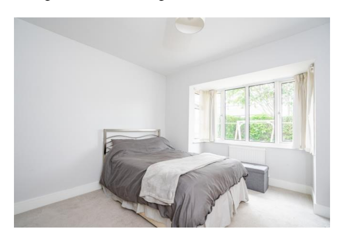
BEDROOM ONE double glazed bay window to front, radiator, television aerial point and feature fireplace.

KITCHEN fitted with a range of wall and base units, space for tumble dryer, space for multifuel cooker with cooker hood over, stainless steel sink and drainer, space and plumbing for washing machine, space for fridge freezer, radiator, windows to side and rear, glazed door to rear garden.