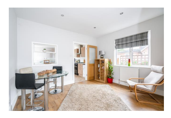
DINING ROOM double glazed window to side, radiator, fitted cupboard and engineered flooring.