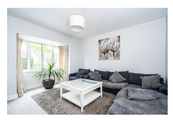
LIVING ROOM double glazed bay window to front, radiator, television aerial point.

Glazed front door to ENTRANCE HALL radiator, engineered flooring.